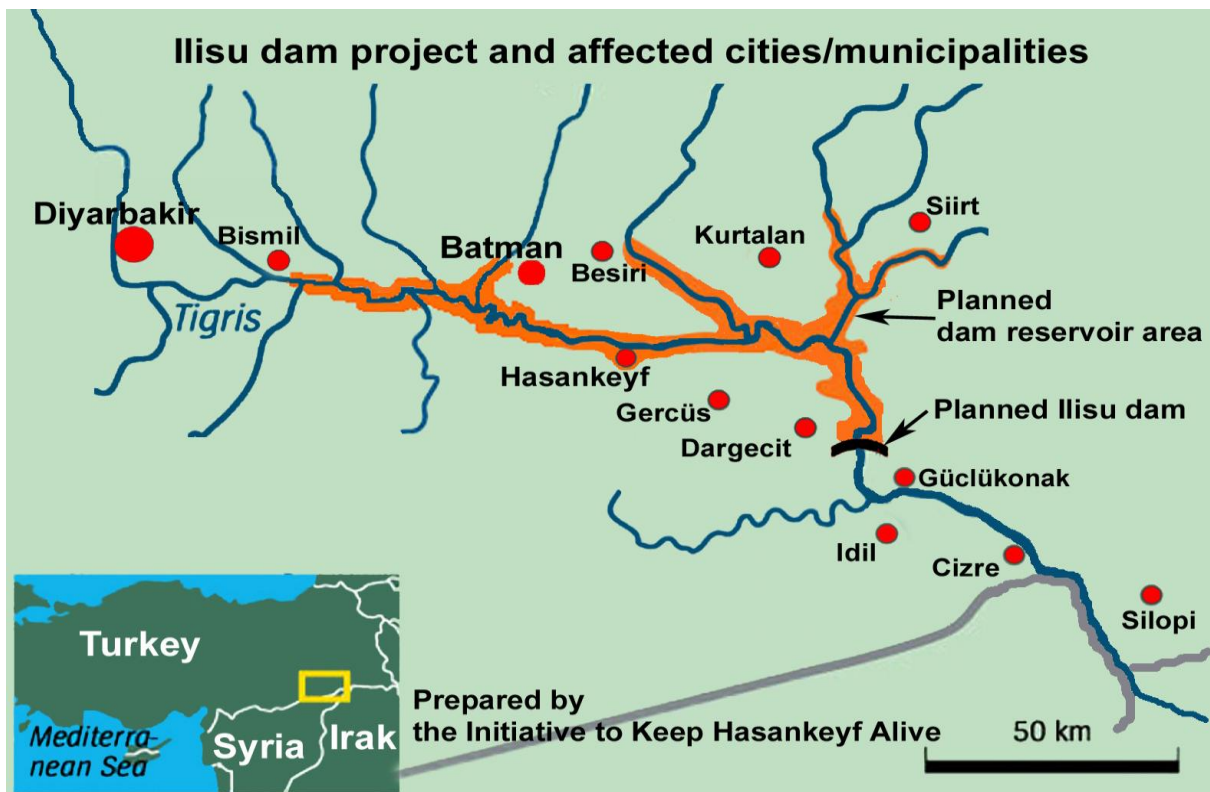
Figure 2. Area affected by the Ilisu Project (GegenStromung and Initiative to Keep Hasankeyf Alive, 2009).

Another remnant of the Kurdish conflict are government-appointed 'village guards', charged with 'protecting' Kurdish villages. These guards tend to abuse their position; for example, when the authors of this article visited the region to gather information about the impacts of the Ilisu dam project in October 2007, we were arrested by village guards and taken to the local military post (Eberlein and Ayboga, 2007). Inquiries by the Kurdish Human Rights Project showed that due to the strong military presence and omnipresence of the village guards, people most affected by the Ilisu dam are reluctant to voice their opinions about the dam (KHRP, 2005).